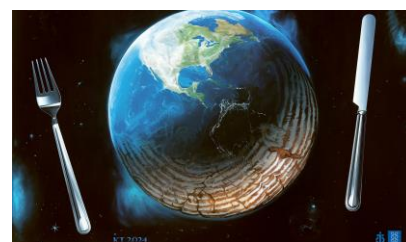
The 2025/2026 Lenten veil "Das grosse Fressen" ("The Great Feast")

On the Lenten veil , images of the Earth and bread fuse on a cosmic background. The result is an "Earth loaf". The artist explains: "Both are essential for the existence of humankind. Without the Earth there is no grain, and without grain there is no bread. However – next to the Earth loaf there is a knife and fork, ready to dig in. The cutlery is an invitation and a warning at the same time. If the bread is cut into, then so is planet Earth." These thoughts lead to the following questions: Who is eating the world? Who feeds and who is fed? Who is full and whose future is being devoured?